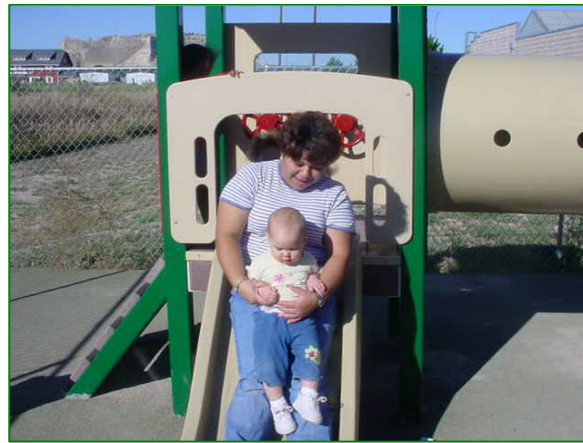
"Beginning at birth, infants are ready to learn".

Our goal is to enhance children's development, empower parents to be nurturing caregivers, and help families reach self-sufficiency.